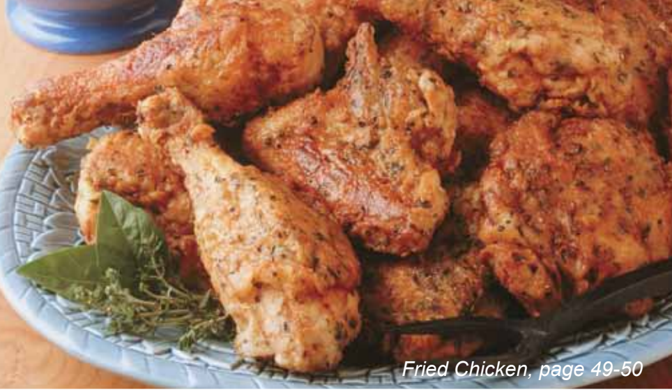
Fried Chicken, page 49-50