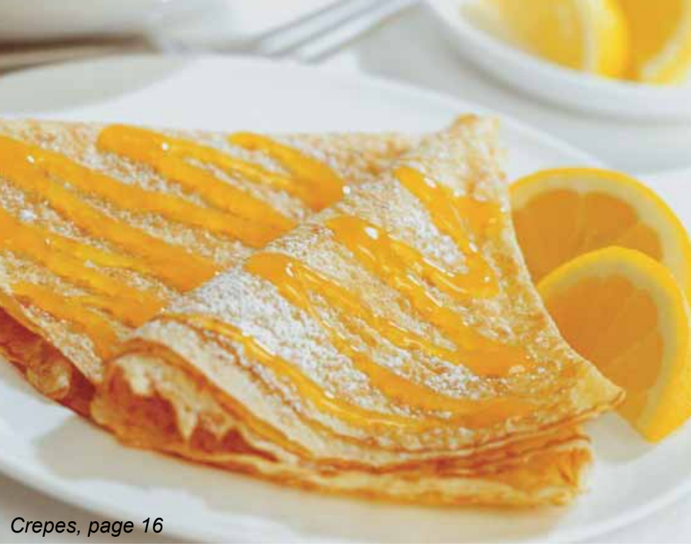
Crepes, page 16