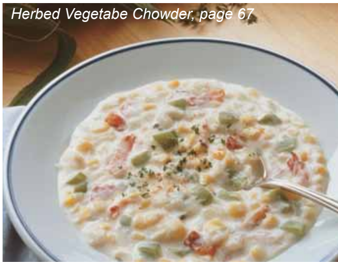
Herbed Vegetable Chowder, page 67