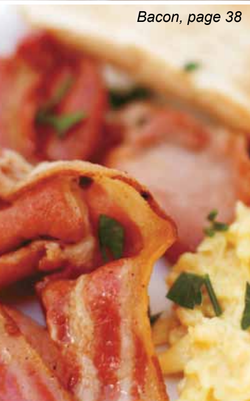
Bacon, page 38