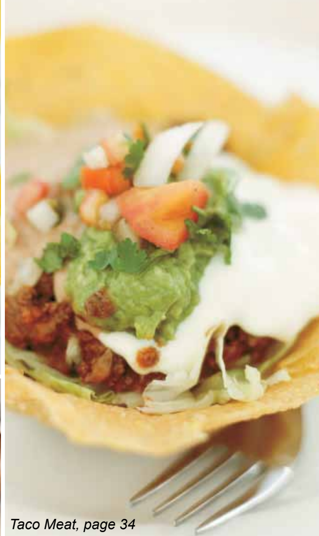
Taco Meat, page 34