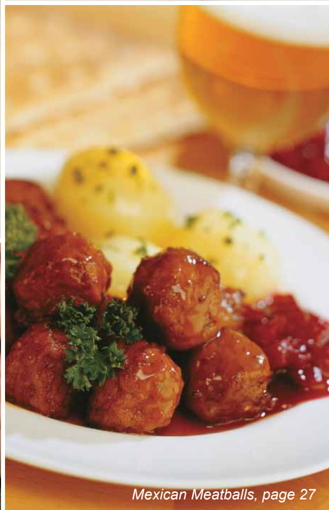
Mexican Meatballs, page 27