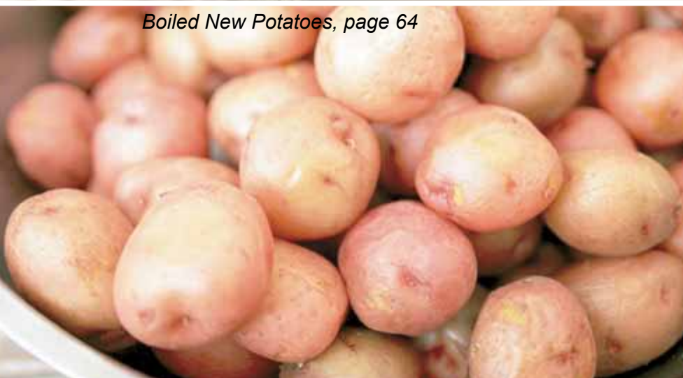
Boiled New Potatoes, page 64