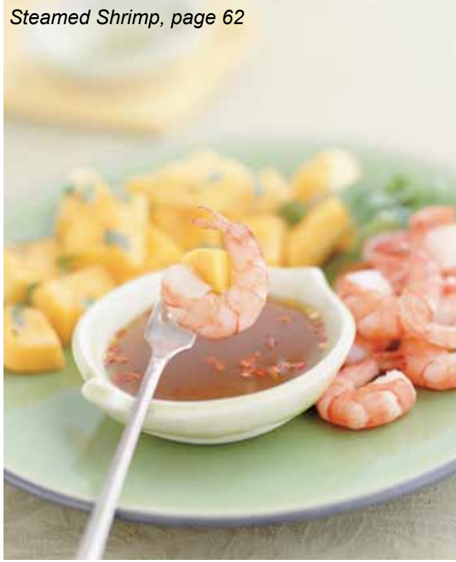
Steamed Shrimp, page 62