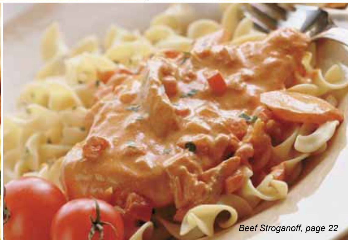
Beef Stroganoff, page 22