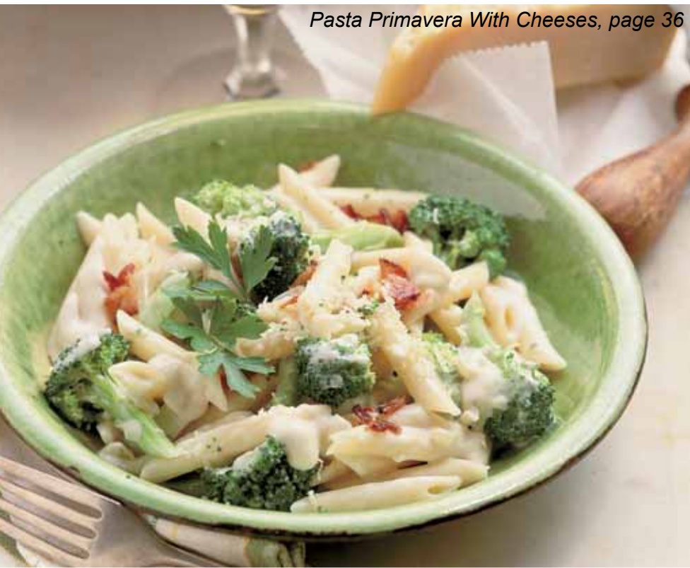
Pasta Primavera With Cheeses, page 36